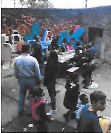
Meanwhile, we hangout with the kids.